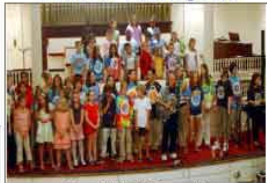
The LUNCH Ensemble