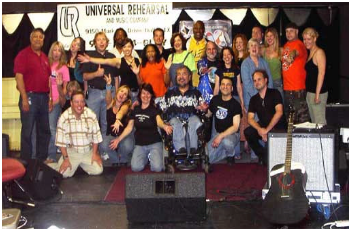
Songwriters, performers, producers, managers, and a host of other artists and support professionals gathered for 3 days of learning and networking.