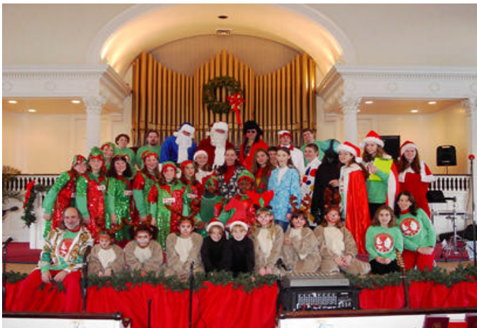
The Cast of SANTAPLICITY 4 CSA artists with 30 supporting performers