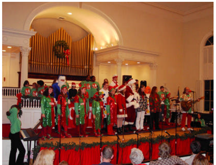
The Ensemble closes with "All My Life's a Circle" by Hary Chapin